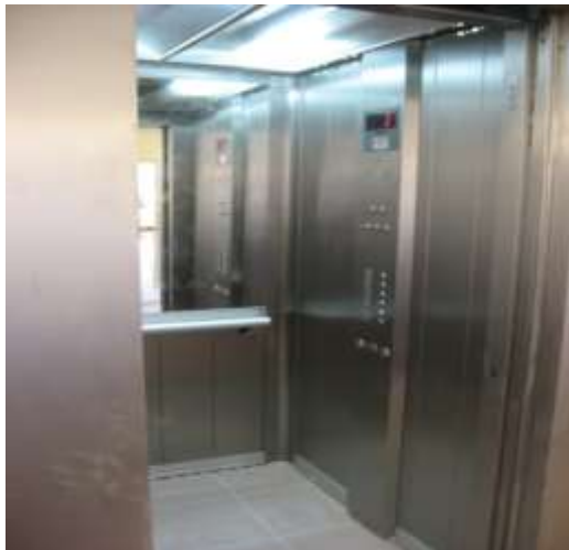
1 Otis M.R.L (5 Stops)