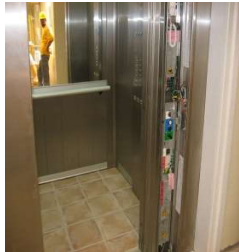
1 Otis Gen II R1(5 Stops)